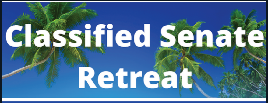
Classified Senate will be hosting our annual retreat at the Tower Club. This event is RSVP only so we hope you were able to sign-up. We hope to see many of you there.