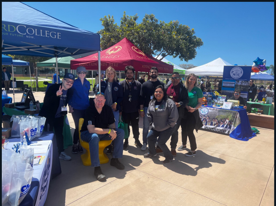
The career center had a very successful Job Fair.