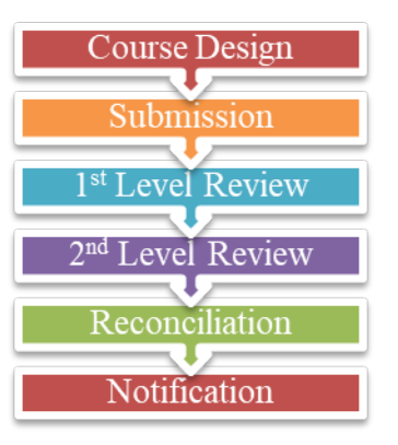
Figure 1: Annual Review Process

CCCs submit new or revised course outlines of record (COR) to the CSU and UC system offices electronically via ASSIST. Intersegmental faculty and staff then evaluate the outlines for alignment with the respective policy documents. CCCs are responsible for submitting accurate and current course outlines. If a course has a decrease in units or has changed substantially since its last review, a CCC should select "Substantial Change" during the course submission process. (For a description of what counts as a "substantial" change, see Submission, below.)