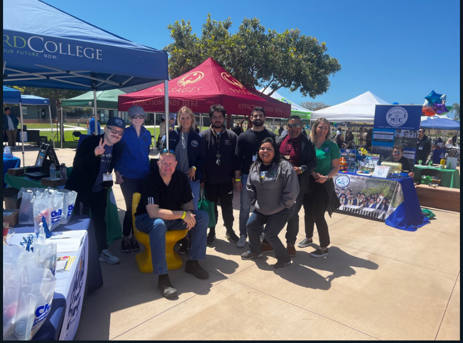
The career center had a very successful Job Fair.