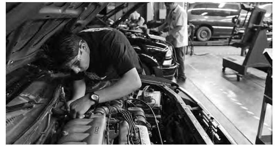
Students work on engines in the Oxnard College Auto Technology Program