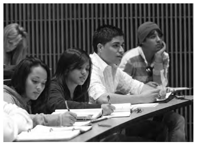
Students taking notes in History class.

CERTIFIED COURSES — Oxnard College will also certify courses completed at other California Community Colleges or California State University campuses in partial satisfaction of GE requirements provided that such courses are baccalaureate level and would be certified by the institution offering them. Students who have completed courses at other colleges and universities should consult the Counseling Office regarding "pass along" certification.