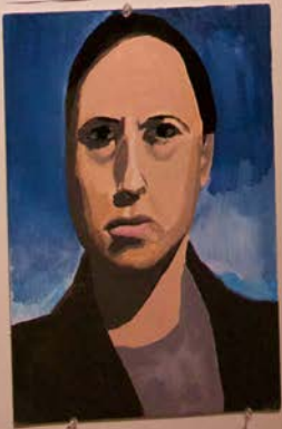
Portrait of a Woman by [Name] [Date]