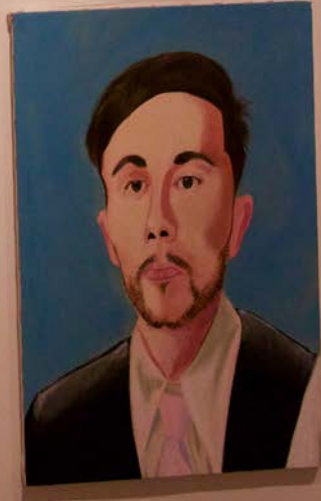
Portrait of a Man by [Name] [Date]