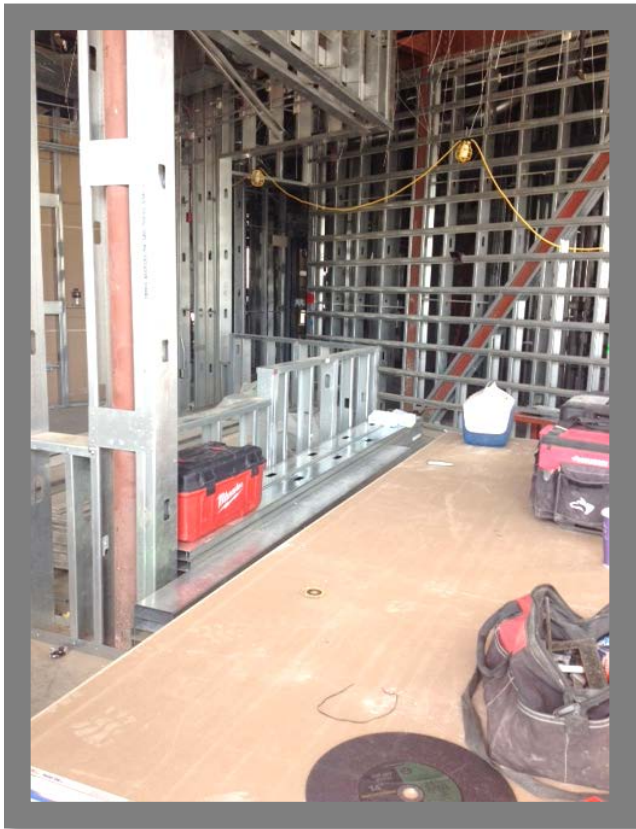
Dental Hygiene - Registration Desk

I recently had the opportunity to view the progress of the Dental Hygiene Building and the renovation of Condor Hall. Here's a few pictures you might enjoy.