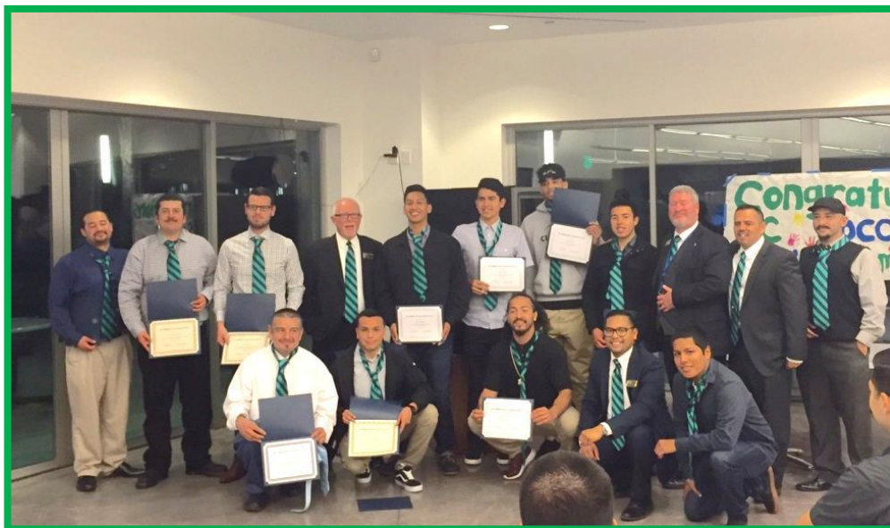
The men of the OMEGA Initiative

Every Wednesday – SHOW YOUR CONDOR SPIRIT – Sport Your “Condor wear”!