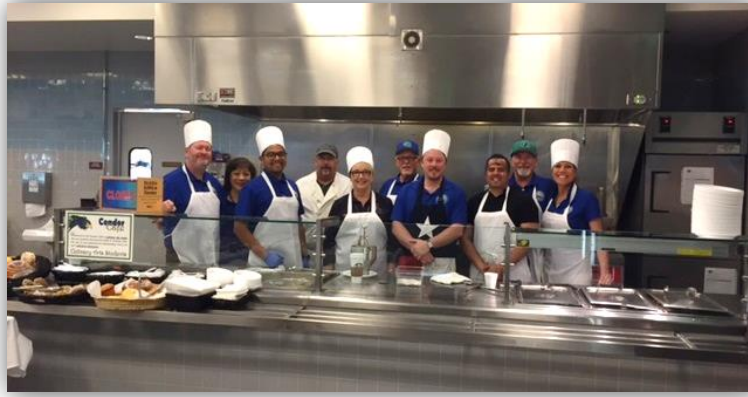
Our Leadership Team ready to serve at the Classified Staff Appreciation Breakfast