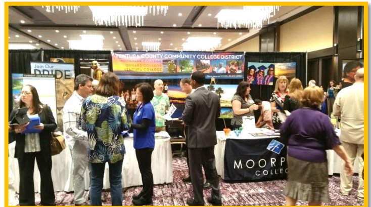
An overview of the VCCCD booth.