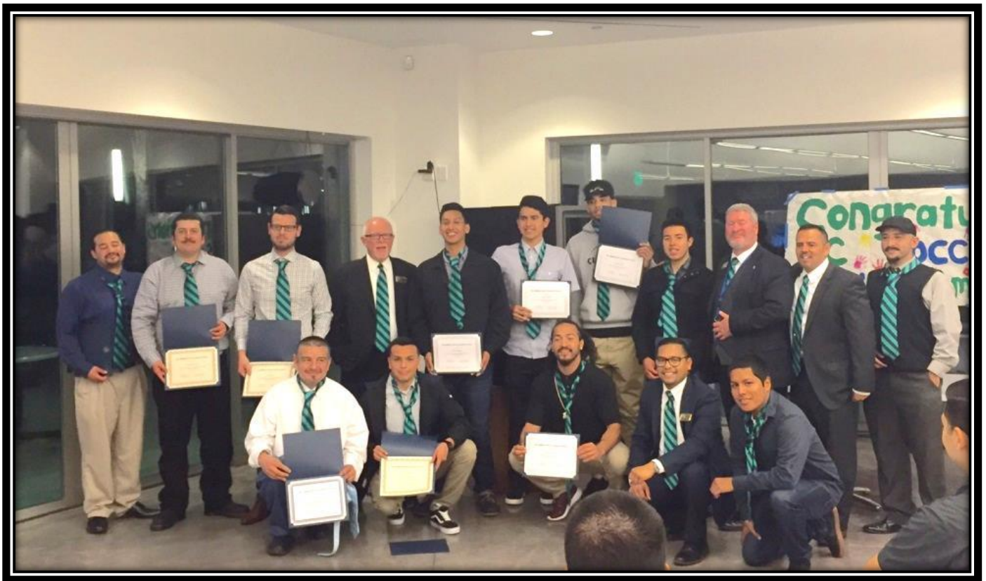
The men of OMEGA Initiative, sporting their official OC blue and green ties, courtesy of the Oxnard College Foundation.