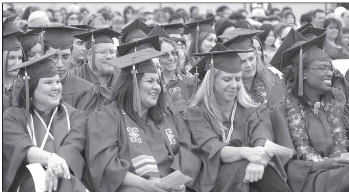
Oxnard College 2006 Graduation