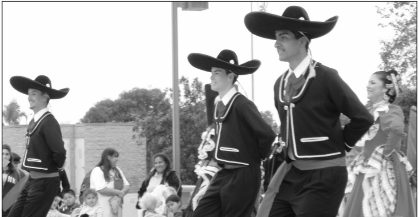
Members of the Oxnard College Ballet Folklorico Mestizo Dance Group perform at the second annual Oxnard College Multicultural Arts Day.

Successful completion of course(s) prepares students to take necessary exams.