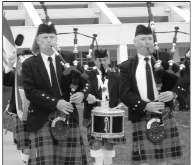
A Scottish bagpipe brigade leads the "Procession of Cultures" at the second annual Oxnard College Multicultural Arts Day.

California Lutheran University General Education Requirements are listed on page 57-58.