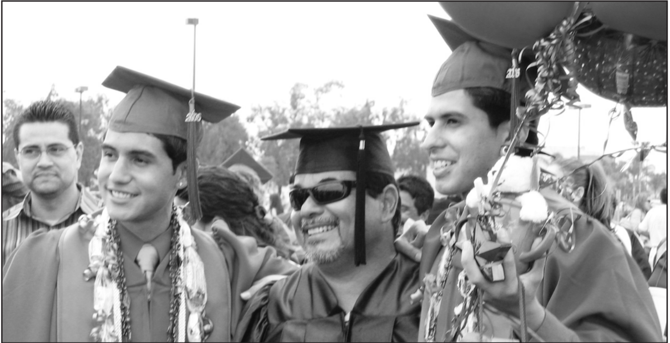
Oxnard College 2006 Graduation