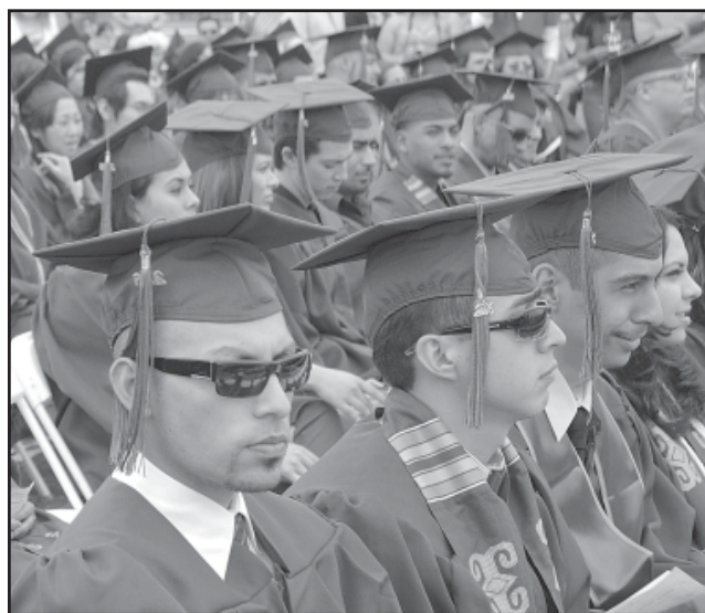
Oxnard College 2006 Graduation

The IGETC 2006-2007 Certification Plan is on the following page.